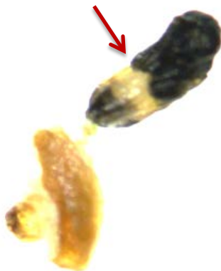
Fig. 3 Pupa of A. quinarius (arrow) attached to a L. serricorne larva.

The insect is a parasitoid wasp of cosmopolitan distribution that attacks several species of weevils in stored grains. The host preferences of this species contrasts somewhat with those of A. calandreae . Specifically, it prefers to attack certain Anobiidae, for example Stegobium paniceum or Lasioderma serricorne ; however, it can easily be reared on Sitophilus spp. [13]. A. quinarius is an idiobiontic ectoparasitic wasp. The females use their ovipositor to drill holes in e.g. chickpeas, paralyze the host larvae and place an egg on the outside of the host larva. The wasp larva develops on the outside of the host while sucking out its inside. Finally, the wasp larva pupates and hatches (fig. 3).