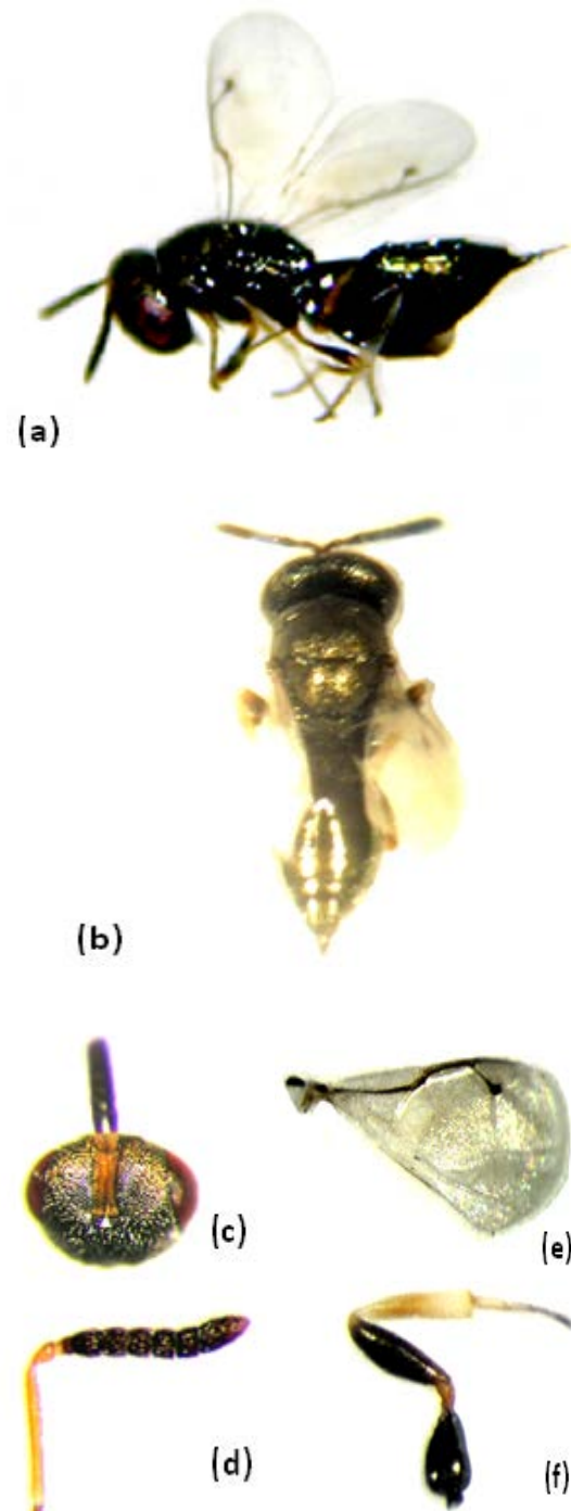
Fig. 1 A. quinarius female: (a) lateral view, (b) mesosoma in dorsal view, (c) head in frontal view, (d) antenna, (e) forewing, (f) leg.

male exhibits a lack of pigmentation in the ventral base of the gaster (fig. 2 b, c).