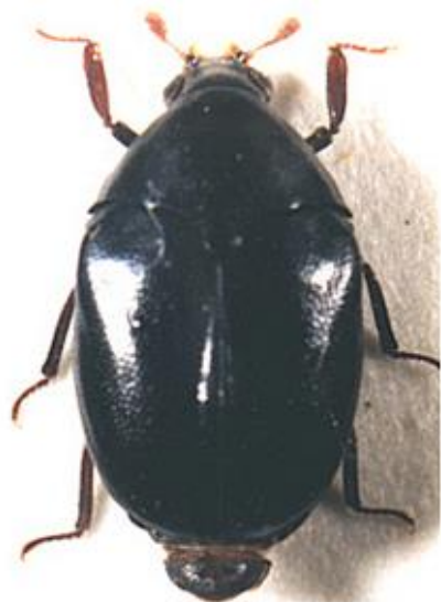
Fig. 2. Photograph of the collection material.

Orphilus subnitidus Le Conte, 1861: 109 (Synonymy: Orphilus glabratus Le Conte, 1878: 471; Orphilus glabratus var. Subnitidus Jayne, 1882: 373; Orphilus chalybaeus Casey, 1900: 164; Orphilus aequalis Casey, 1900: 164; Orphilus niger Spencer, 1942: 27) [21, 22]. Distribution: Canada, and East USA (North American continent). Fig. (1. 2).